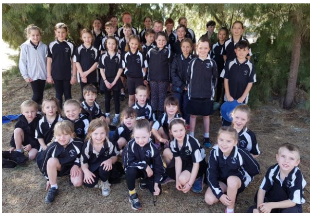
Flagstone Creek SS 2019 Ball Games Competitors

As a staff we would like to congratulate our Year 5/6 children for the way they helped organise other students and events on the day. Great sportsmanship and participation was shown by all.